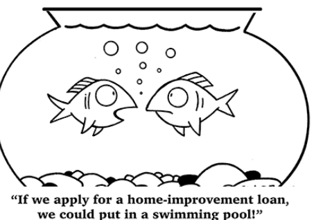
we could put in a swimming pool!"