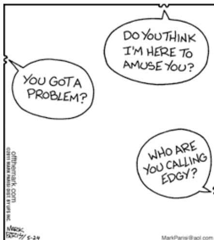
BORDERLINE PERSONALITY DISORDER

This event will be held on Thursday, 7 July at 6.00pm in the Olympic Hall, 288 Franklin Street, Adelaide. All are welcome to come along and